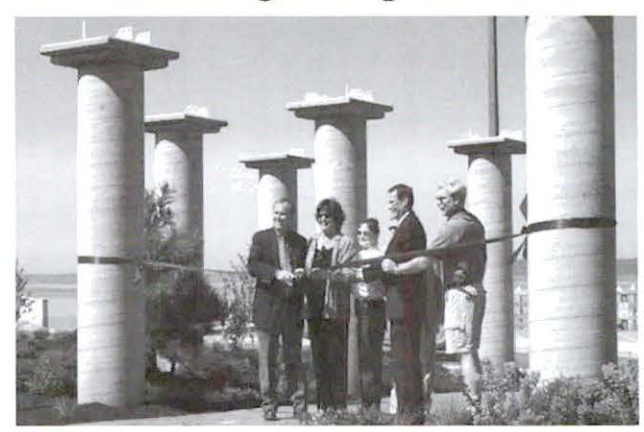
April 30th Ribbon Cutting Ceremony

Safety tips from the Des Moines Fire Department are listed on page 2.